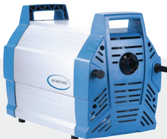
ME 16C NT 16.3 m 3 /h 70 mbar