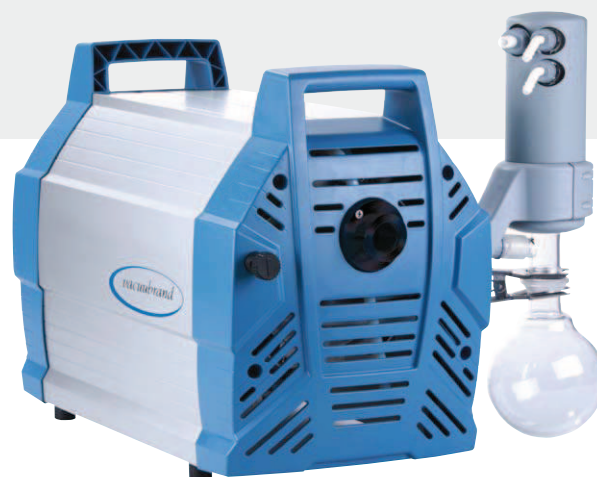
ME 16C NT +EK 16.3 m 3 /h 70 mbar